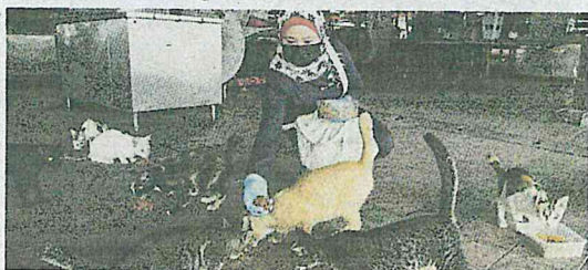
Pemilik haiwan peliharaan dinasihat membasuh tangan kerana dibimbangi haiwan terbahit dijangkiti COVID-19.

Putrajaya: Orang ramai dinasihat membasuh tangan selepas menyentuh haiwan peliharaan kerana dibimbangi haiwan terbahit dijangkiti COVID-19.