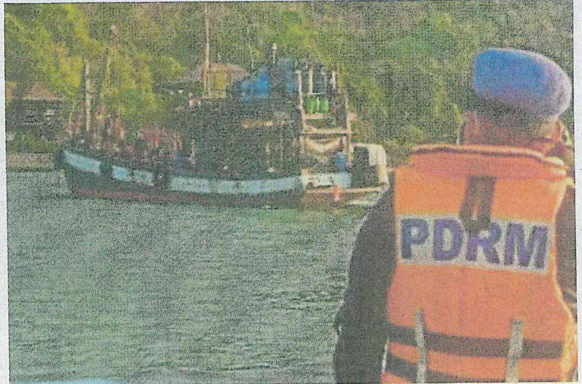
Sebahagian pelarian Rohingya ditemui atas kapal dikuarantin di Pulau Langkawi.

“Kita dimaklumkan semalam hanya tiga orang merentasi sempadan (Singapura-Johor). Arahan