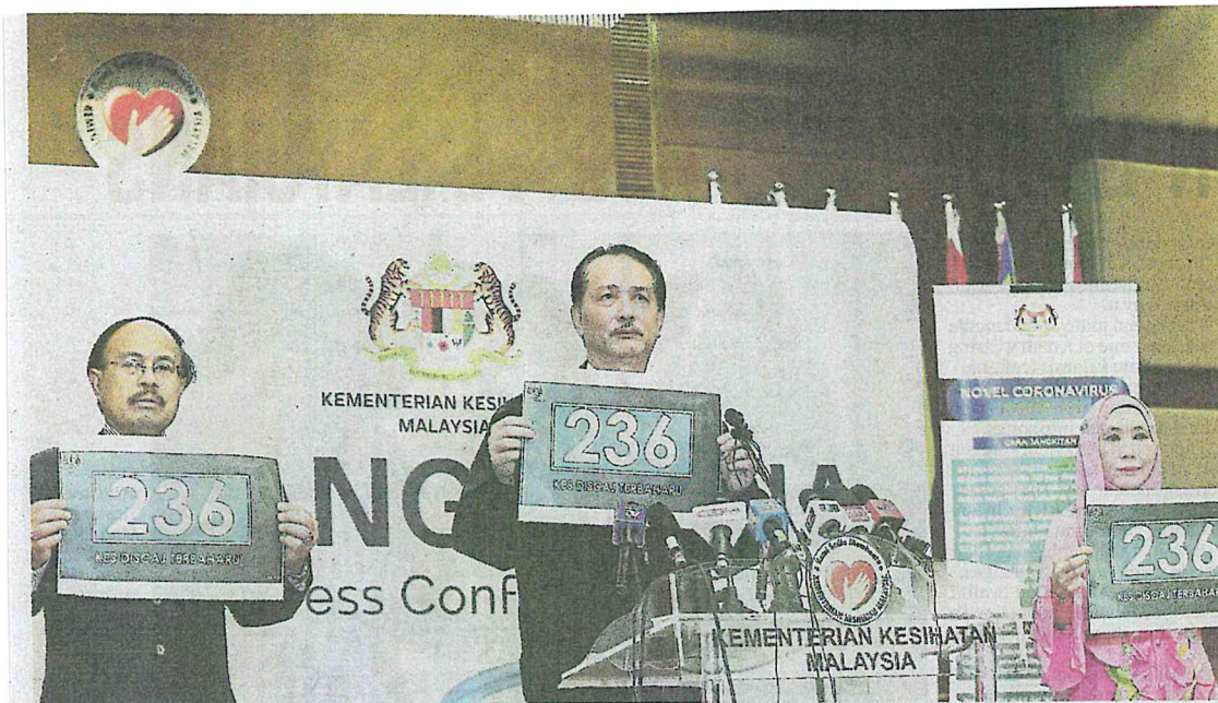
Health director-general Datuk Dr Noor Hisham Abdullah (centre) showing the number of patients who recovered from Covid-19 for the day at a press conference in Putrajaya yesterday.