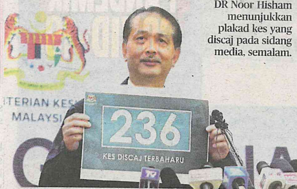
DR Noor Hisham menunjukkan plakad kes yang discaj pada sidang media, semalam.

Kes kematian ke-62 (kes ke-3,663) adalah lelaki warganegara Malaysia berumur 67 tahun dan mempunyai latar belakang penyakit kencing manis dan darah tinggi.