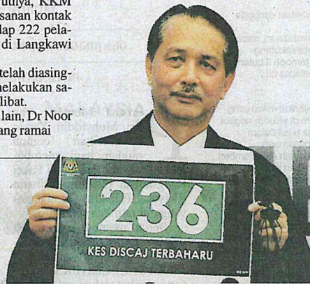
Dr Noor Hisham menunjukkan bilangan kes discaj terbaharu pesakit yang telah pulih dan tertinggi sehingga semalam pada sidang media harian berkaitan jangkitan Covid-19 di Kementerian Kesihatan semalam.

Sebelum ini, tular di media sosial, seorang wanita yang dipercayai kakitangan hospital berkongsi gambar beberapa kotak topong penutup hidung dan mulut yang dikatakan diambil dari hospital.