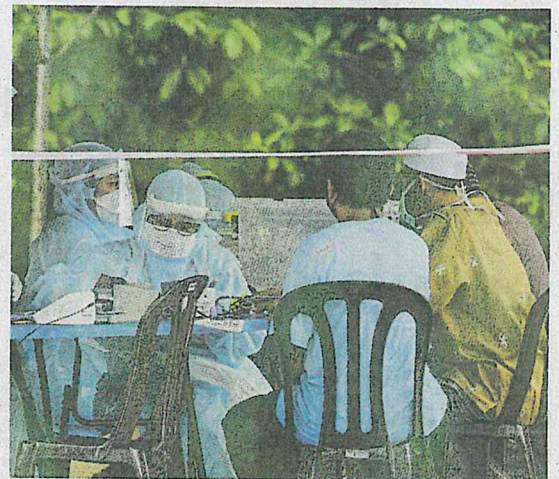
Petugas barisan hadapan menjalankan ujian saringan COVID-19 terhadap penduduk Kampung Sungai Lui, Hulu Langat, semalam.

"Kita dalam PKP ini bukan hanya untuk tamatkan jangkitan virus, tapi matlamat utama adalah kurangkan kes. Jadi kita duk rumah akan dapat kurangkan kes. Kita tidak akan lihat kes meningkat mendadak," katanya.